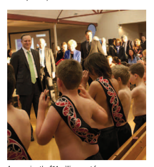
Announcing the $1.1 million grant for Kaiapoi's Aquatic Centre